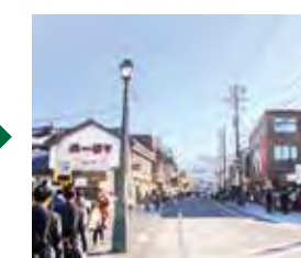
Sakaimachidori Shopping Street