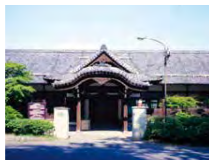
Otaru Civic Auditorium