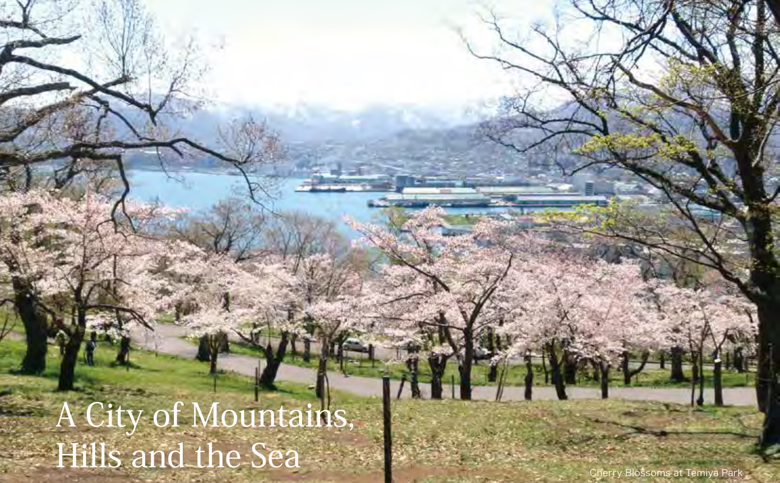
Cherry Blossoms at Temiya Park