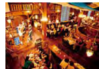
Otaru Beer Otaru Soko No.1