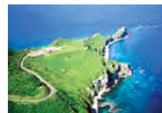
Shakotan Town / Cape Kamui