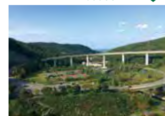
Asari Sky Loop Bridge