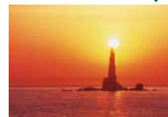
Yoichi Town / Candle Rock

*Note that the length of each course may vary depending on how long you spend at each destination.