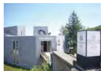
The Glass Studio in Otaru