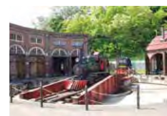
Otaru Museum's Main Building

Discover the old vestiges and heritage of Otaru Canal's North Canal area.