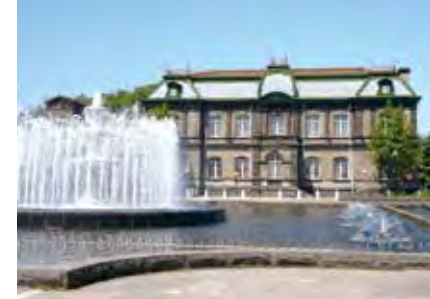
Former Otaru Branch of Nippon Yusen Co.