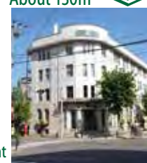
Former Hokkaido Takushoku Bank Otaru Branch (Nitori Museum of Art)