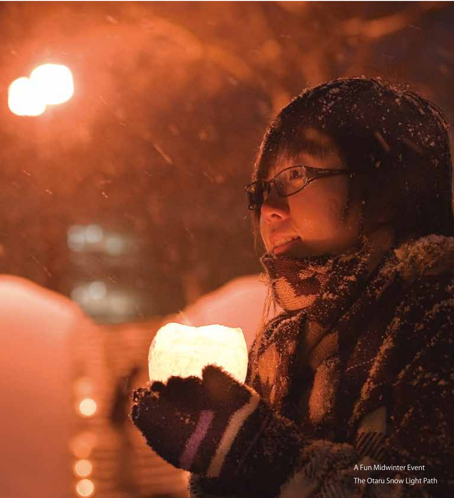
A Fun Midwinter Event The Otaru Snow Light Path