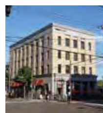
Former Otaru Branch of Mitsubishi Bank (Otaru Canal Terminal)