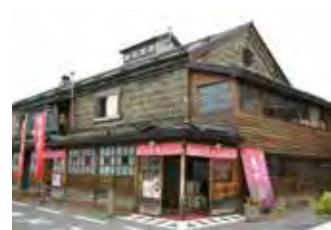
Tanaka Sake Brewery Kikkogura