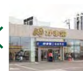
Kamaei Fish Cake Factory Store