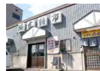
Rinyu Morning Market