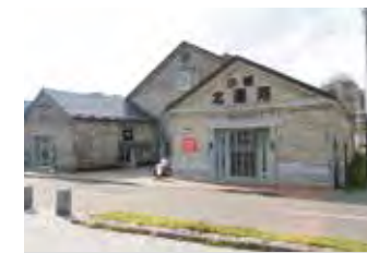
Former Shibusawa Warehouse