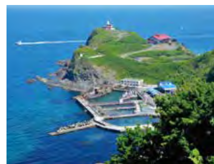
Shukutsu Panorama Observatory