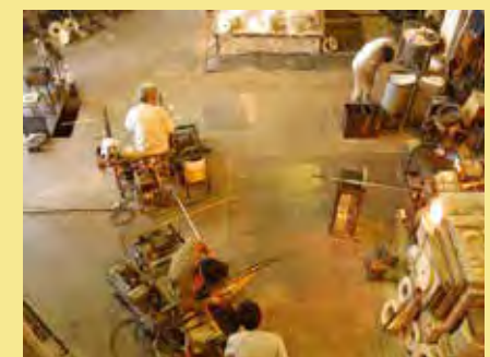
The Glass Studio in Otaru