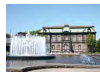
Former Otaru Branch of Nippon Yusen Co.