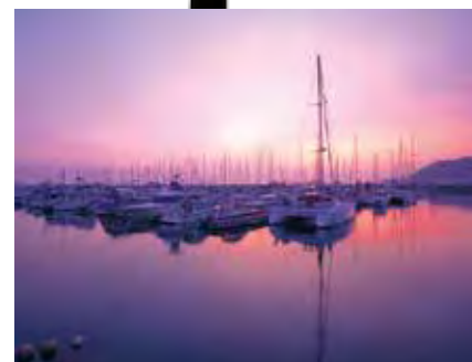
Otaru Port Marina