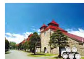
Yoichi Town / Nikka Whisky Hokkaido Factory - Yoichi Distillery