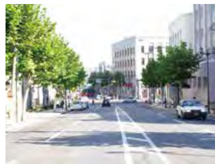
Northern Wall Street