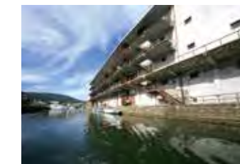
Hokkai Can Otaru Factory