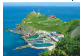
Shukutsu Panorama Observatory