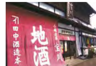
Tanaka Sake Brewery