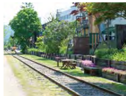
Former Temiya Railway