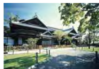
Otaru Kihinkan (The Former Aoyama Villa)