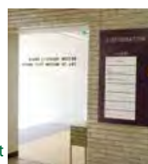
Otaru Museum of Literature & Art