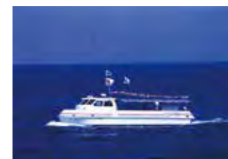
Shakotan Town / Sightseeing cruise aboard the New Shakotan