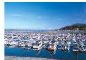
Otaru Port Marina