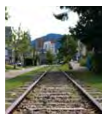
Former Temiya Railway