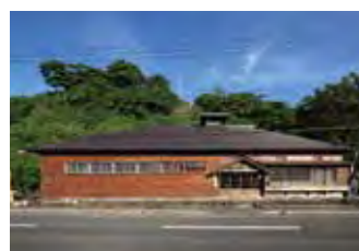
Ibaraki Nakadebari Banya