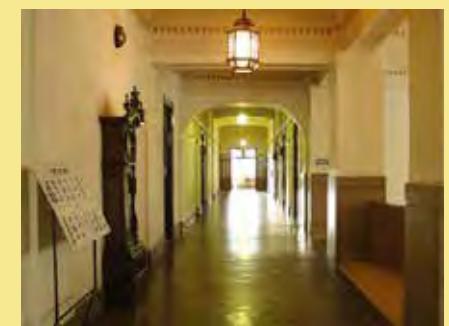
Otaru City Hall