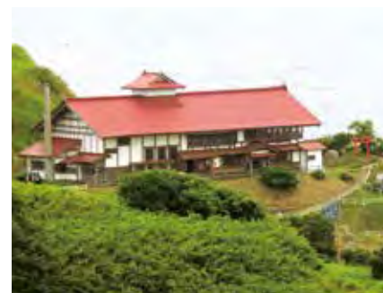
Otaru Herring Mansion