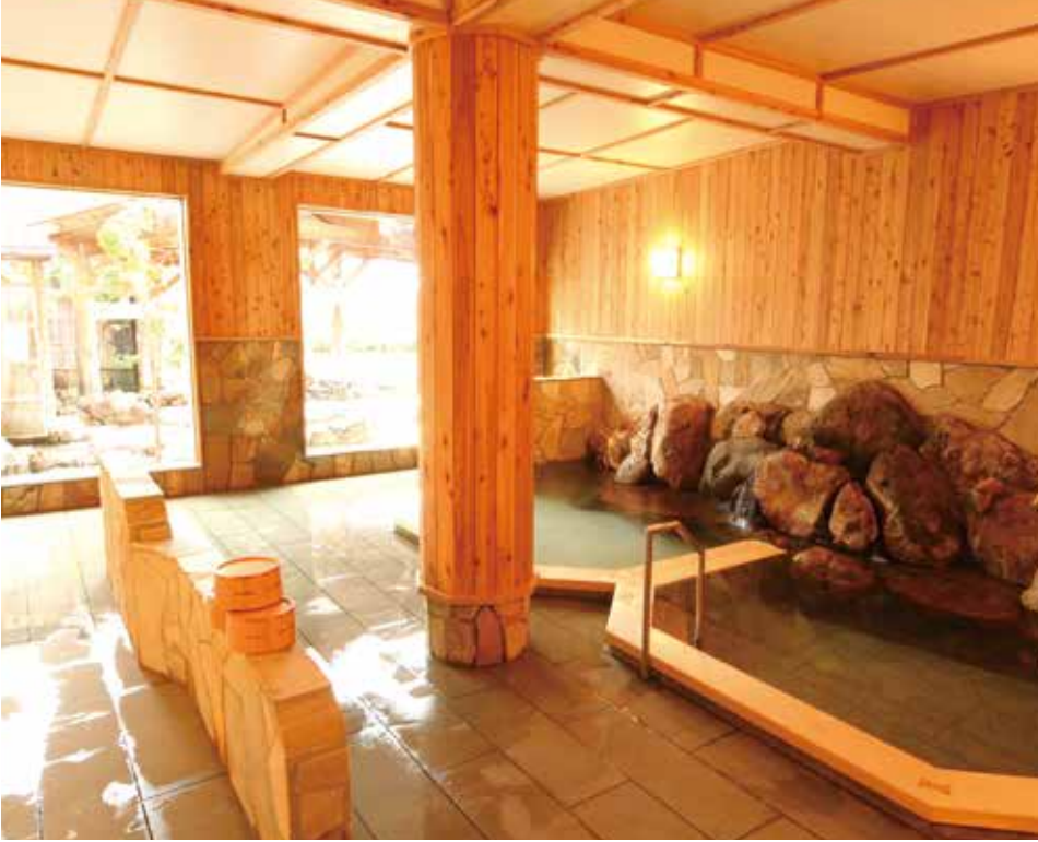
Soak in an open-air onsen to experience the four seasons of nature as they were meant to be.