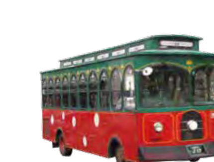
Otaru Stroller's Bus