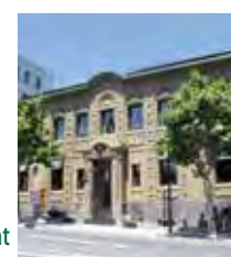
Former Headquarters of Hokkaido Bank (Otaru Bine) About 130m