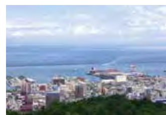
Asahi Scenic Observatory

Witness the stunning views from a scenic observatory and try your hand at glassmaking as well as wine and/or sake tastings.