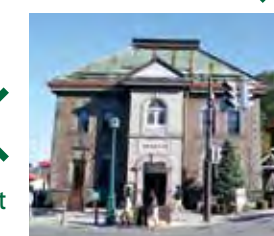
Otaru Music Box Museum