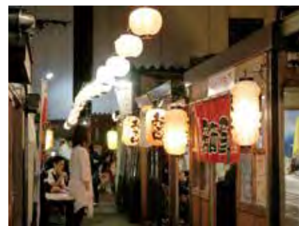
Otaru Yataimura Renga Alley