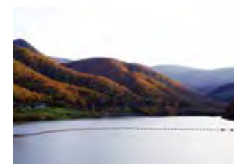
Asari Dam(Lake Otarunai)