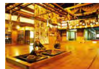
Yoichi Town / Old Shimoyoichi Unjoa