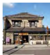
Former Takasaburo Natori Store (Taisho Glass)