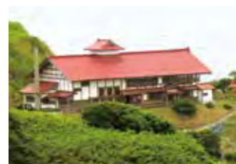
Otaru Herring Mansion

Discover the herring fishing cultural heritage of the Shukutsu area and enjoy the sights and sounds of the Otaru Aquarium.