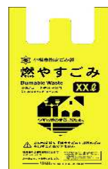
Designated garbage bag

Unburnable garbage --- Place in the designated blue bags. Bottles of cosmetics, oil cans, paint cans, small-sized electrical appliances, pans, kettles, frying pans, wash bowls, buckets, glass, chinaware, stationary, toys, video tapes, cassette tapes, metal products, etc.