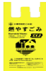
Designated garbage bag

Unburnable garbage --- Place in the designated blue bags. Bottles of cosmetics, oil cans, paint cans, small-sized electrical appliances, pans, kettles, frying pans, wash bowls, buckets, glass, chinaware, stationary, toys, video tapes, cassette tapes, metal products, etc.