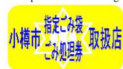
Mark of shops that stock the bags and labels

The designated garbage bags and labels are on sale at supermarkets, convenience stores, general merchandise stores, grocer's stores, etc., displaying this mark.